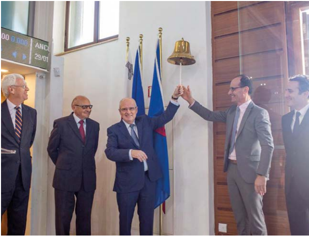
First trading session on the MSE – 31 January 2018.