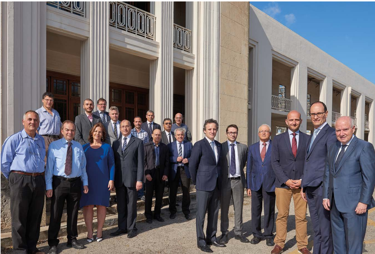
Trident Park Project Team

We are confident that we will rise to the challenges that await us, and are determined to hold service excellence as one of the core values that guide our endeavours. Our focus remains set on delivering a prestigious, efficient and distinctive project that will ensure maximum shareholder returns.